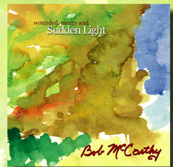
Sudden Light released 2011 Wandra CD 111101