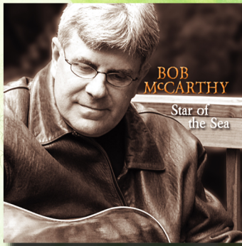
Star of the Sea released in 2005 Wandra CD 050901

Seattle-based author, Clay Eals biographer of Steve Goodman: Facing the Music.